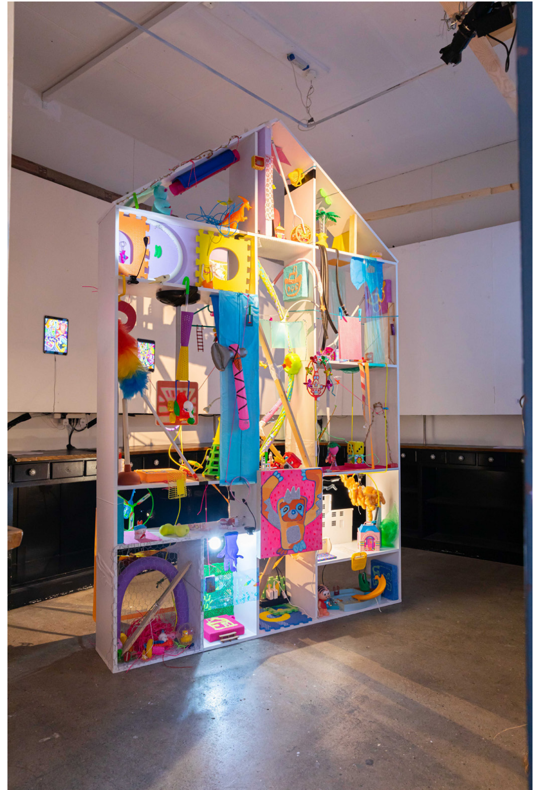
Micro Party 2 , 2022, https://vimeo.com/manage/videos/684178949