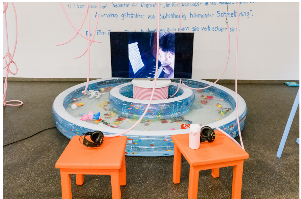
Whirlpool of Fairy Tales , 2020, installation, swimming pool, plastic objects, water, water-course pump, 279cm x 279cm x 36cm https://vimeo.com/684210645