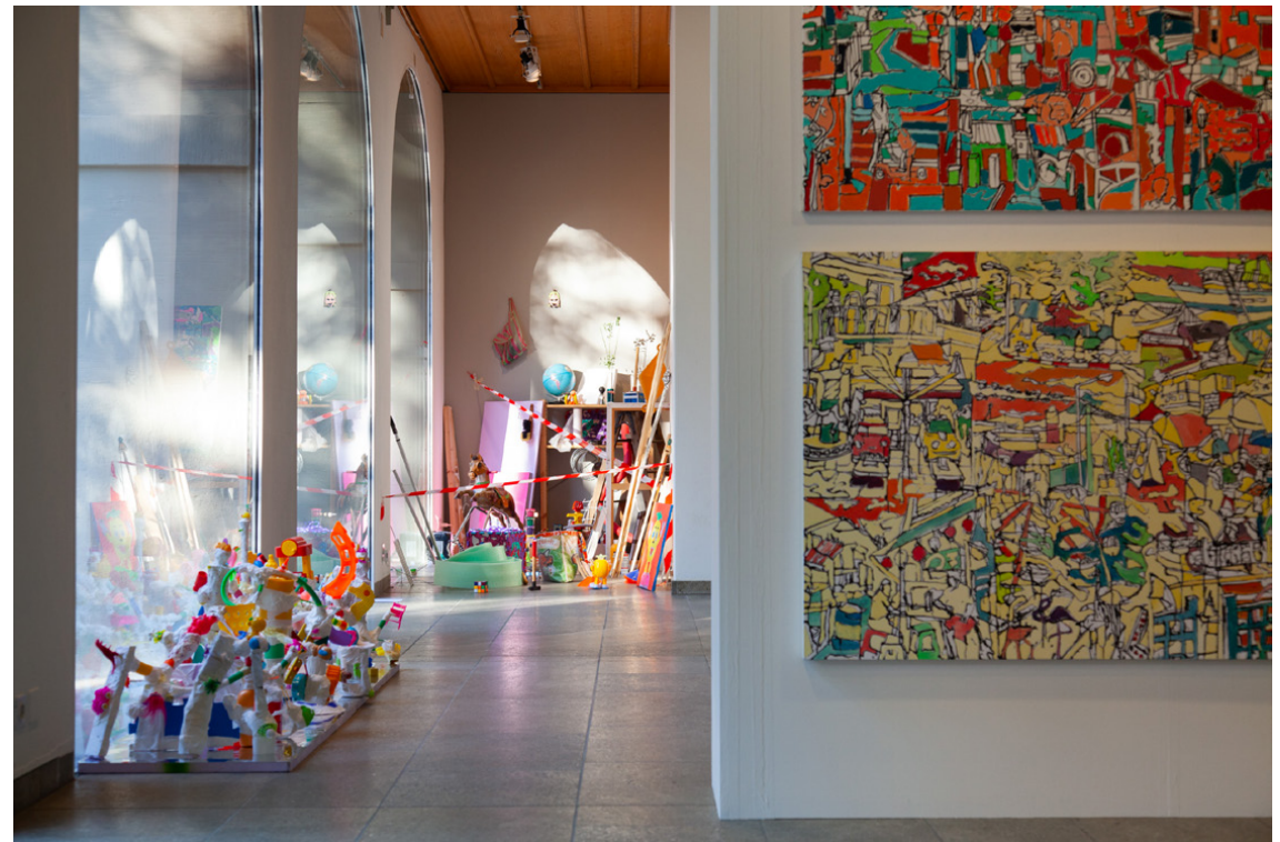
exhibition views: Look@JKON 2019 solo exhibition Kunsthau Zofingen, 2019