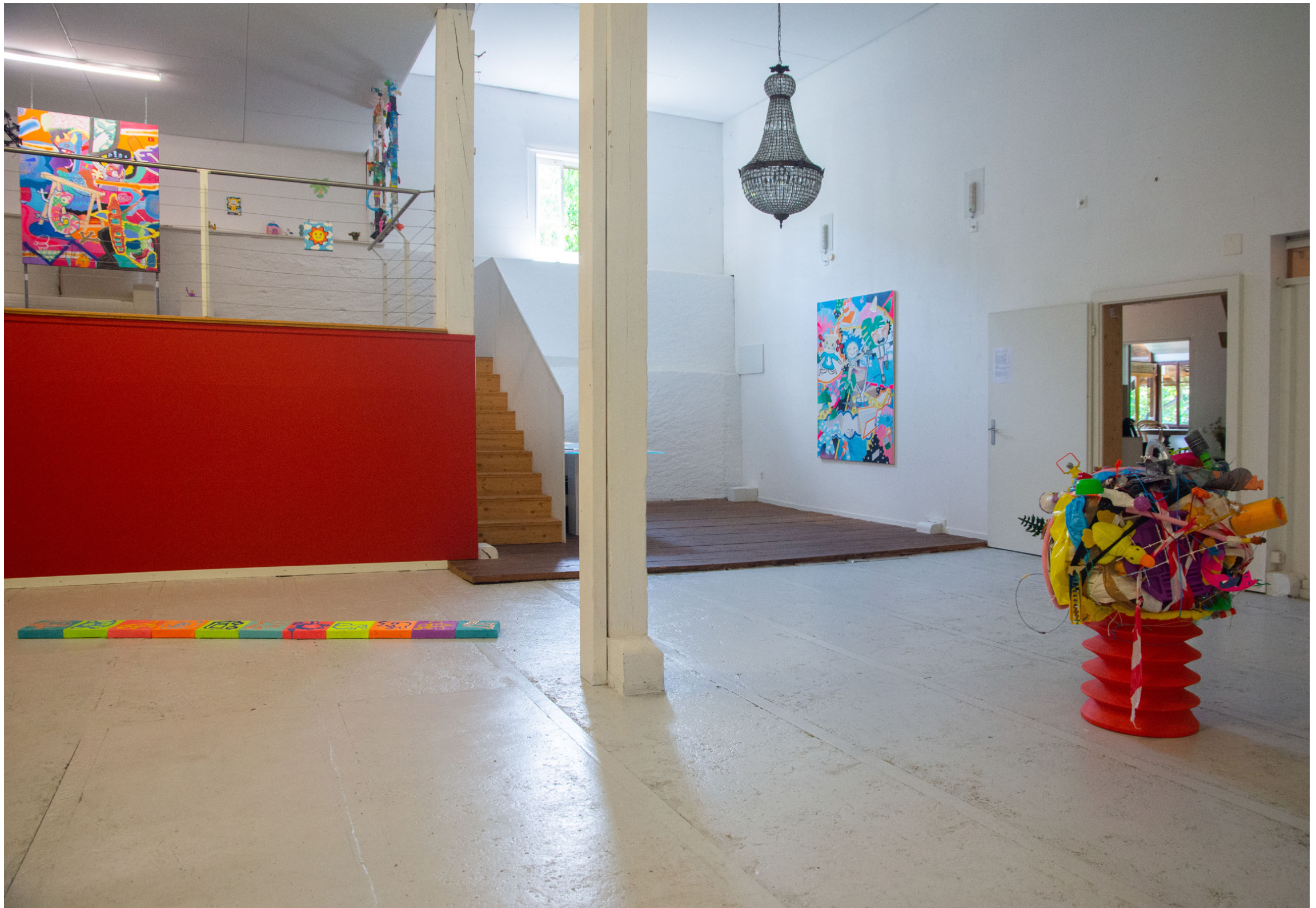
exhibition view: Konfrontation group exhibition Gallery Weiertal 2023