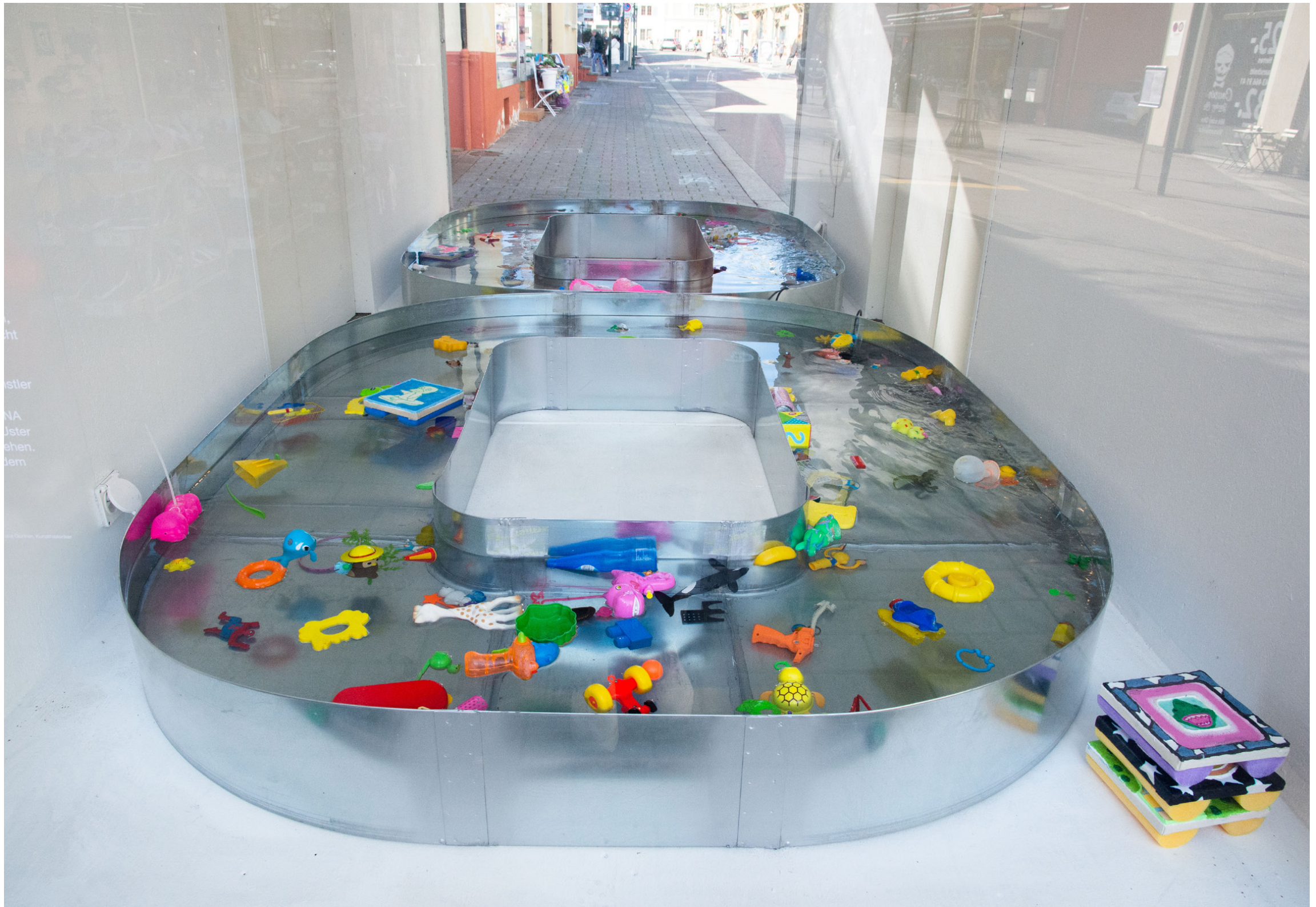
exhibition view: free swimming lessons for everyone solo exhibition KunstKiste Akku Uster 2023 (found toys & plastic objects dancing endlessly in the water driven by a stream pump)