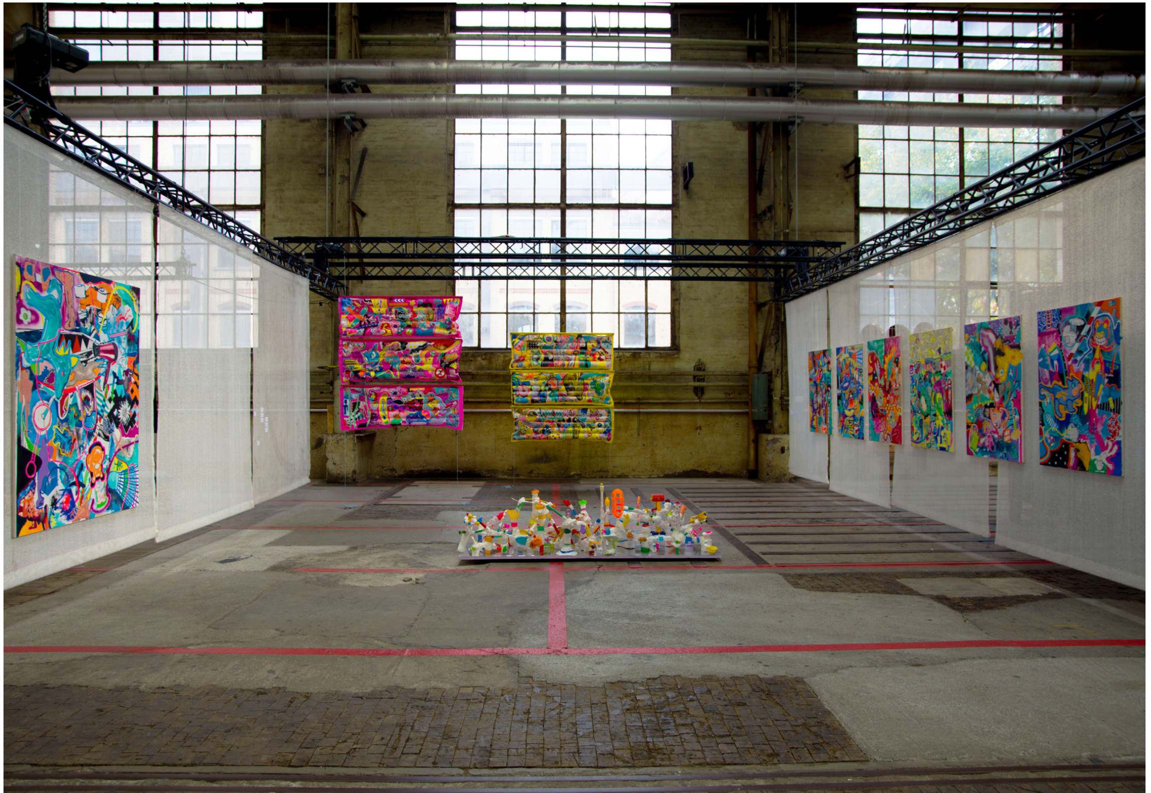
exhibition view: JUNGGUNST 2019 group exhibition Halle 53 Winterthur 2019