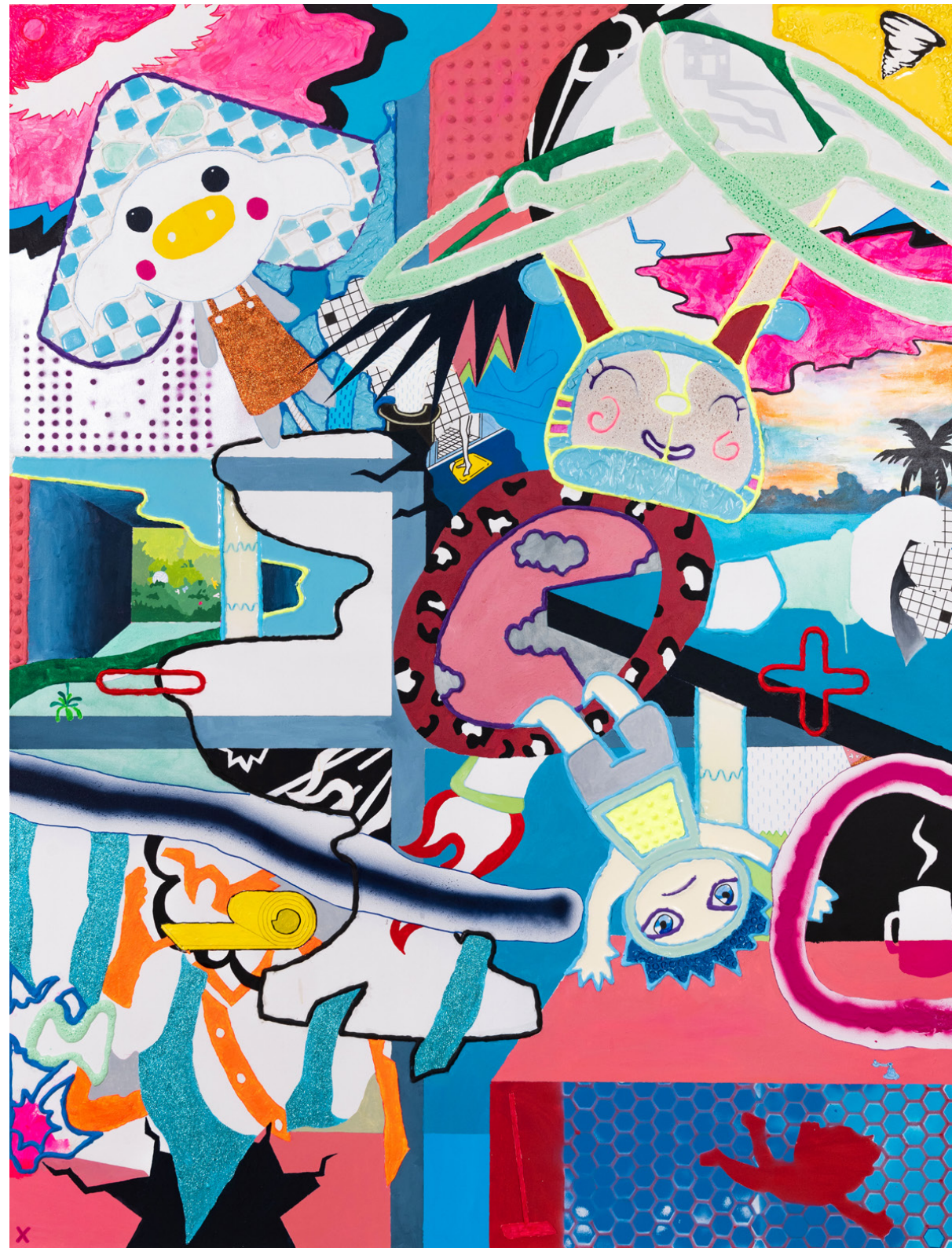
after work mood & a toy may do anything 2022 painting mixed media on canvas 170cm x 130cm