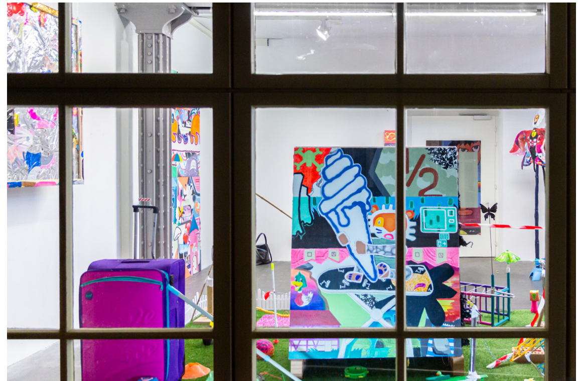
exhibition views: erstens: Frag den Schmetterling solo exhibition Vebikus Kunsthalle Schaffhausen, 2022