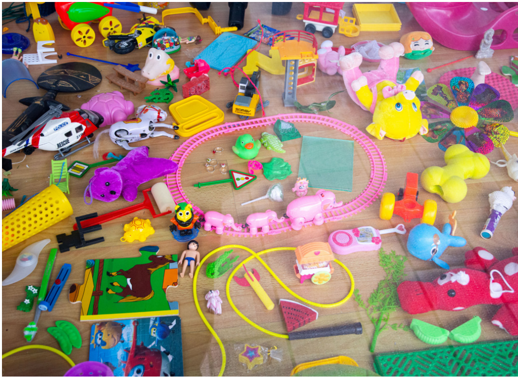
exhibition views: Schaufensterkunst solo exhibition Atelier62, Schaan, 2022