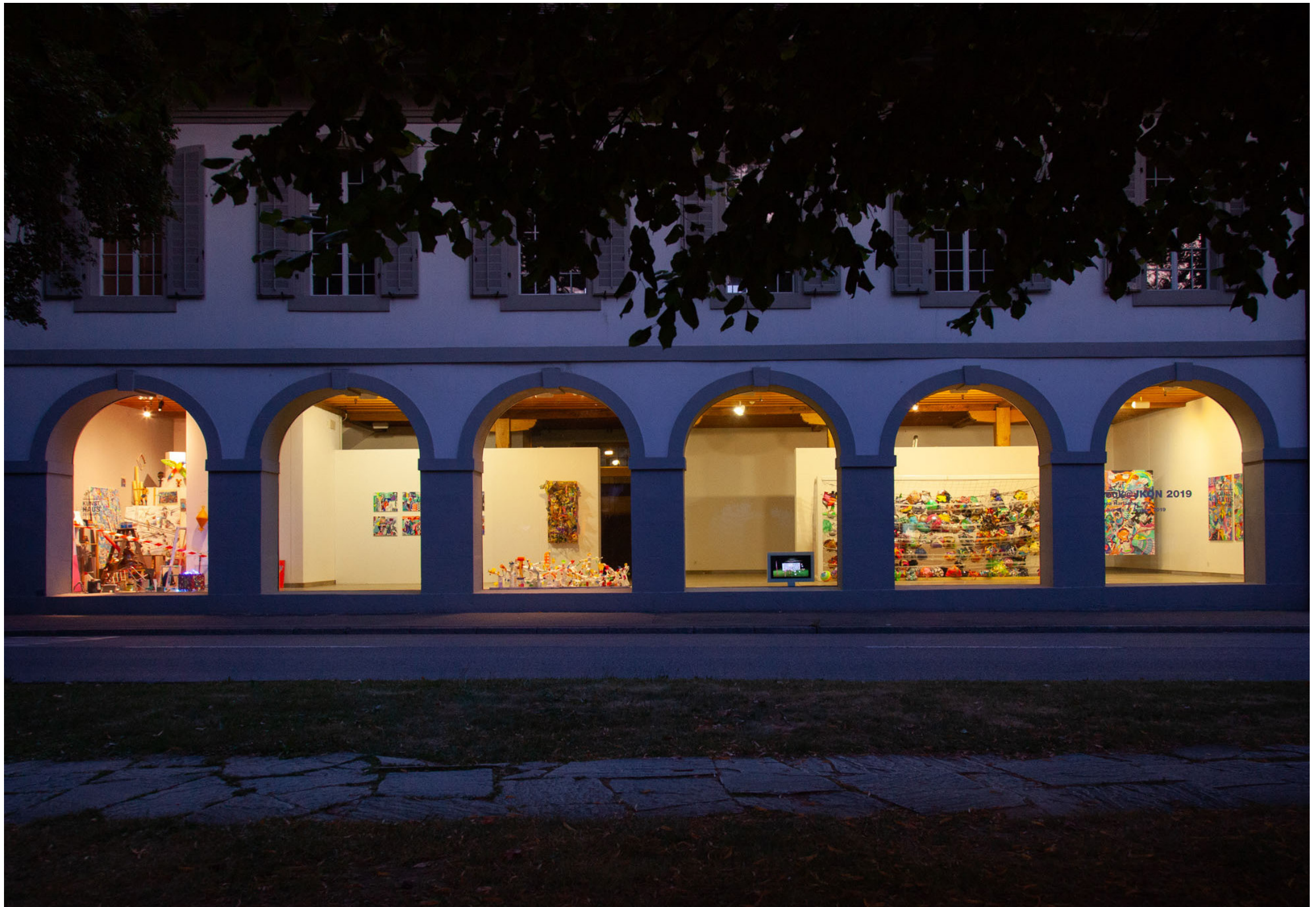
exhibition view: Look@JKON 2019 solo exhibition Kunsthaus Zofingen, 2019