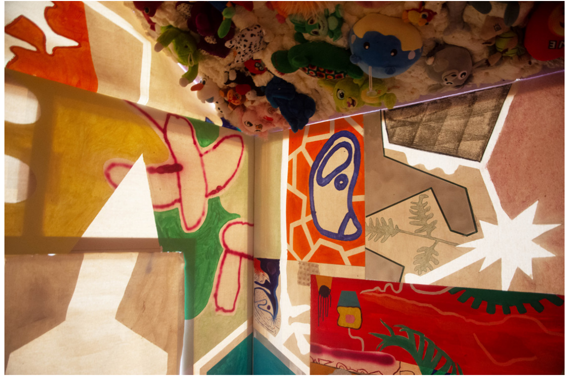
interior views: Between Painting and Wall, 2020 walk-in installation mixed media 265cm x 190cm x 220cm