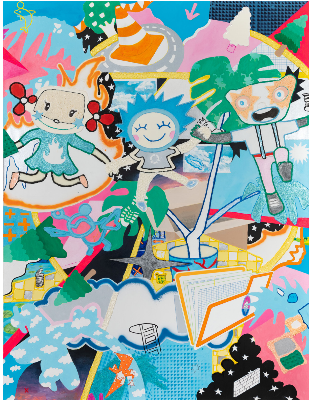
blow away the clouds and lets commit to optimism 2023 painting mixed media on canvas 170cm x 130cm