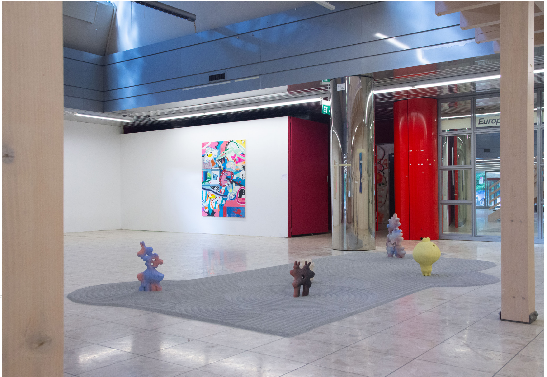
exhibition view: Last Words from the periphery III group exhibition AtTheOffspace, Zurich, 2022