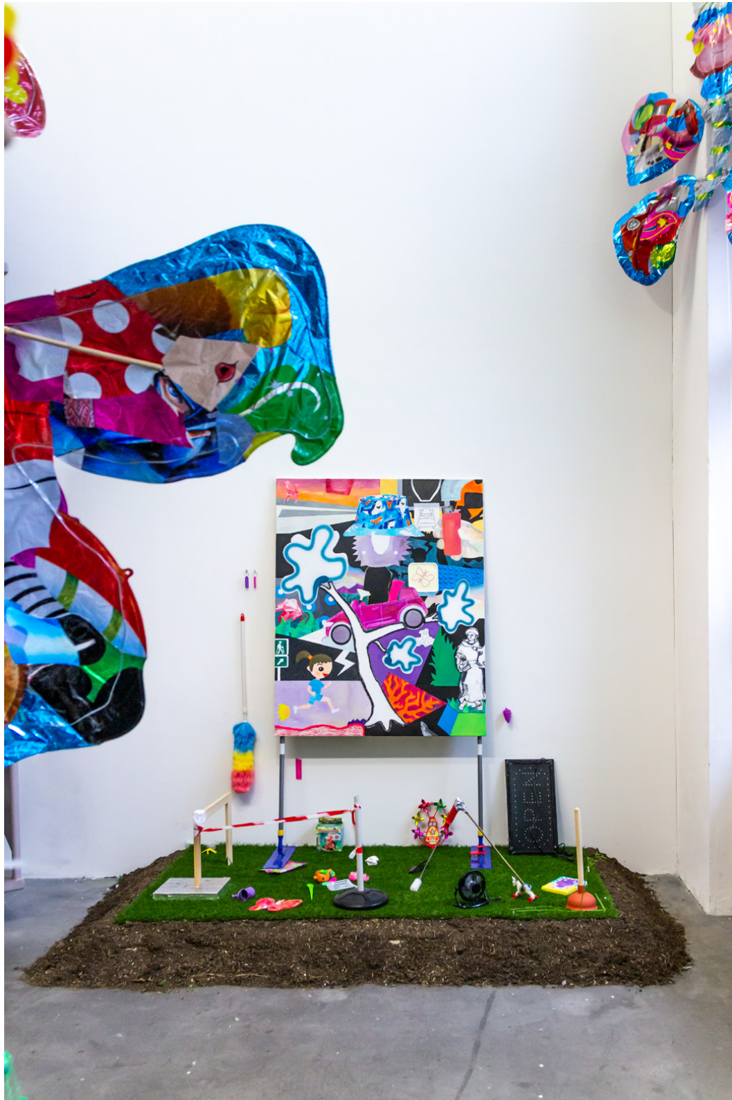
exhibition views: erstens: Frag den Schmetterling solo exhibition Vebikus Kunsthalle Schaffhausen, 2022