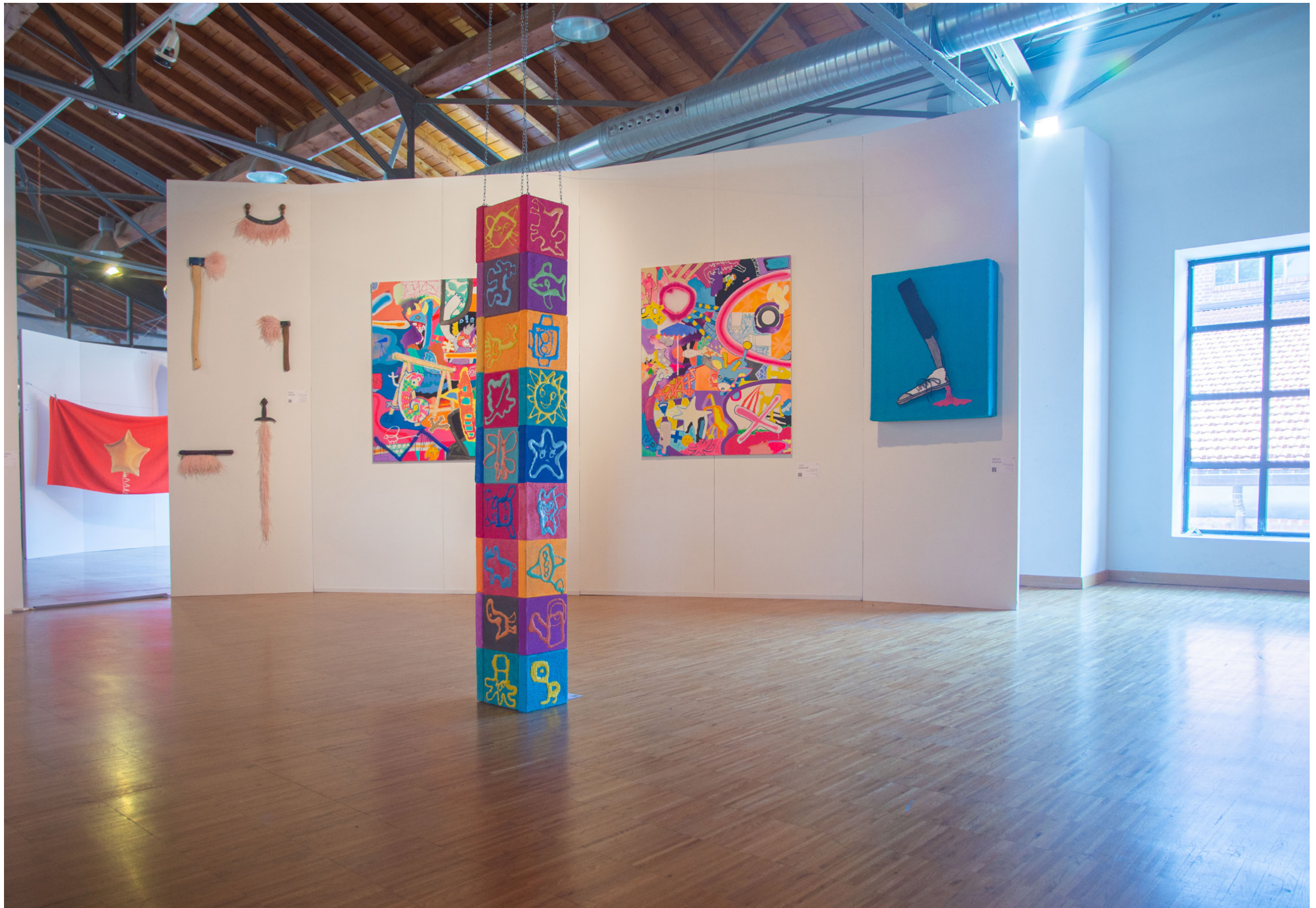
exhibition view: ReA! Art Fair Fabbrica del Vapore, Milano 2021