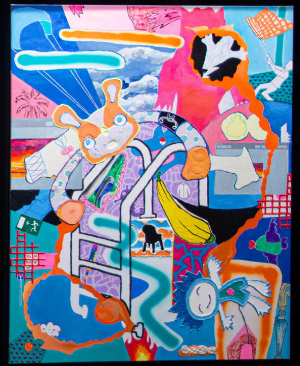
exhibition view: KUNSTpause group exhibition, Chollerhalle Zug, 2021